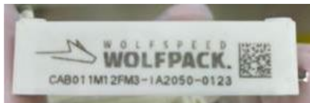
Figure 1. (a) Current and (b) New Laser Marking.