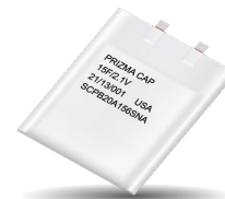
Figure 2 - A comparison of KYOCERA AVX supercapacitor offerings