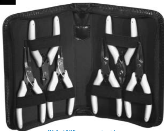
RFA-4080 — serrated jaws RFA-4081 — smooth jaws